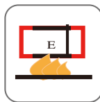
Circuit Integrity IEC 60331-23/BS 6387(Optional)